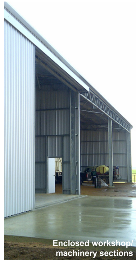
Enclosed workshop/ machinery sections

CALL TODAY FOR YOUR DESIGN & QUOTE 1300 271 220