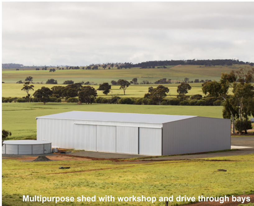
Multipurpose shed with workshop and drive through bays