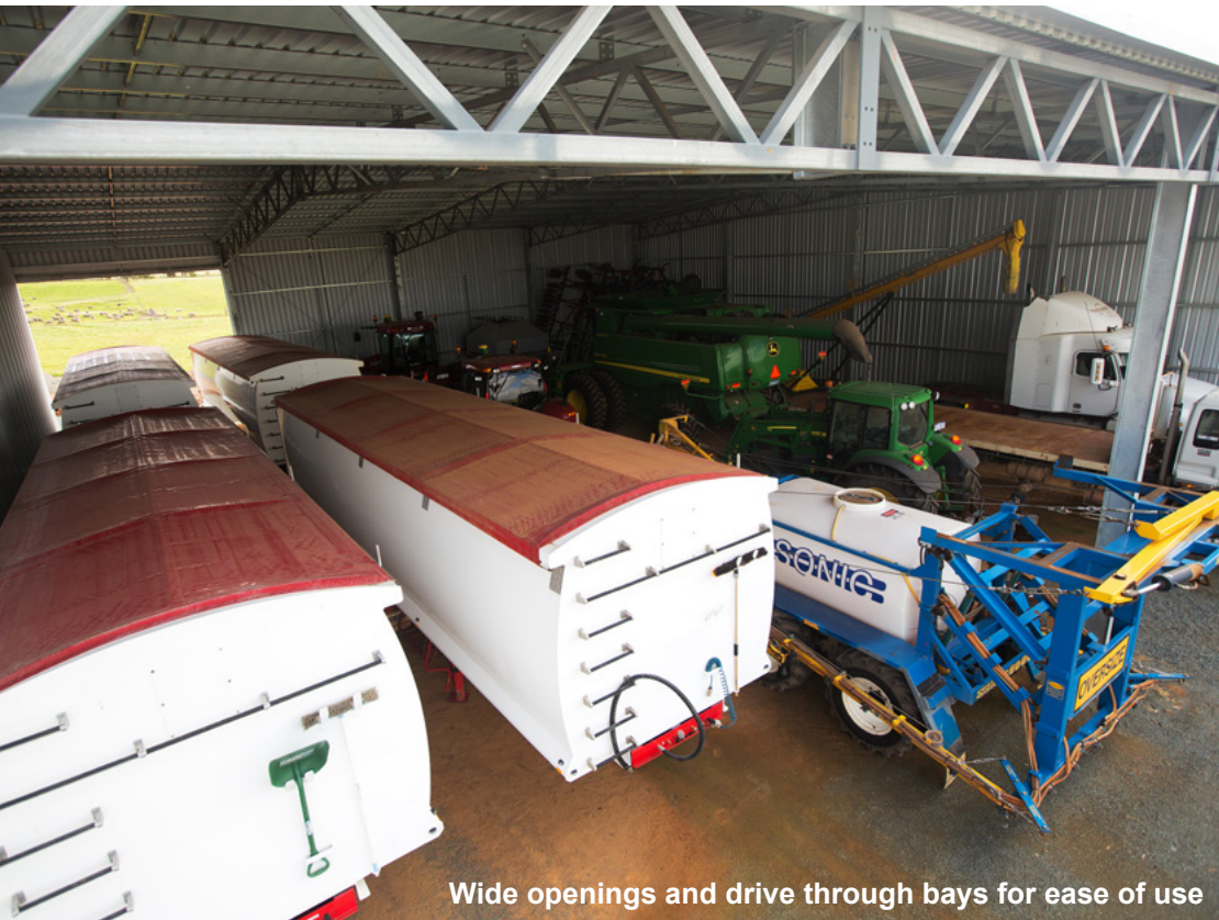
Wide openings and drive through bays for ease of use