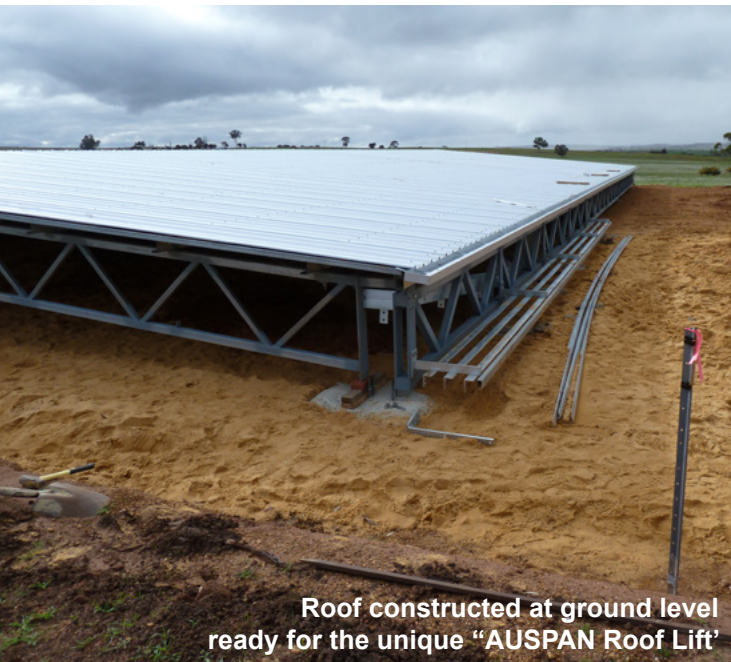
Roof constructed at ground level ready for the unique "AUSPAN Roof Lift"

WA's LEADER IN THE DESIGN & CONSTRUCTION OF STEEL FRAME SHEDS AND BUILDINGS