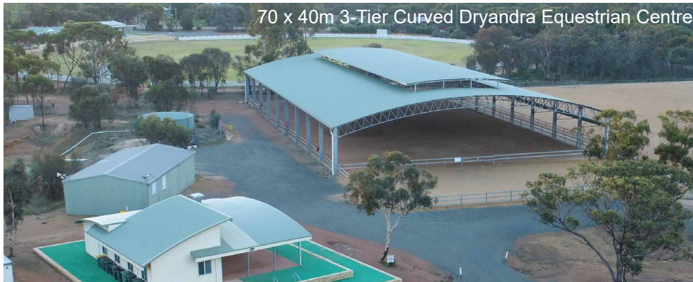
70 x 40m 3-Tier Curved Dryandra Equestrian Centre

WA's LEADER IN THE DESIGN & CONSTRUCTION OF STEEL FRAME SHEDS AND BUILDINGS