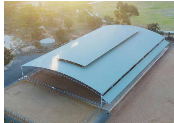
Roof highlight for added aesthetics and ventilation